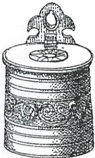
19TH-CENTURY PINE WALL SALT