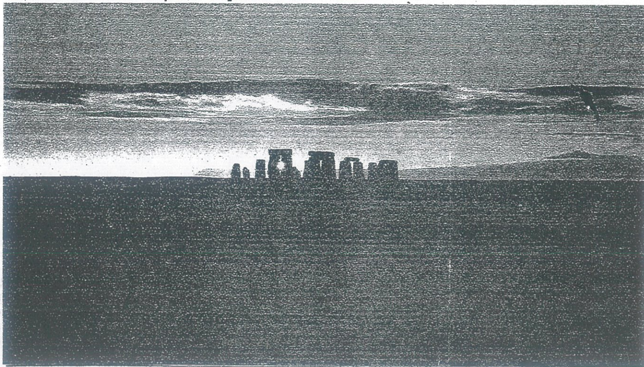
STONEHENGE AT SUNSET.

Such discoveries should encourage students of ancient British civilization to seek the answers to their problems in the knowledge of British-Israel identity. ■